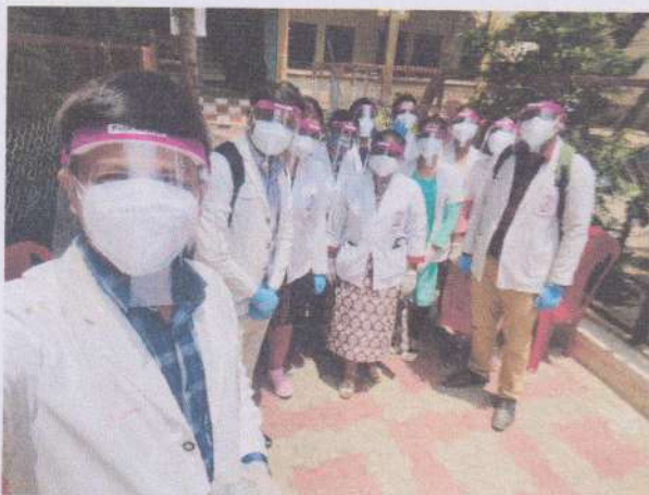
Team deputed to the camp

The taluka was divided into 23 different wards and each team was allocated with one separate ward. Each team visited every single house in the ward and screened every individual of the family above the age of 18 years for covid related symptoms and also for their oxygen saturation levels and pulse rate. During the camp, nearly 80 individuals were screened by each team from different wards.